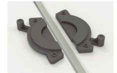
Team Flip - Link Unlocked