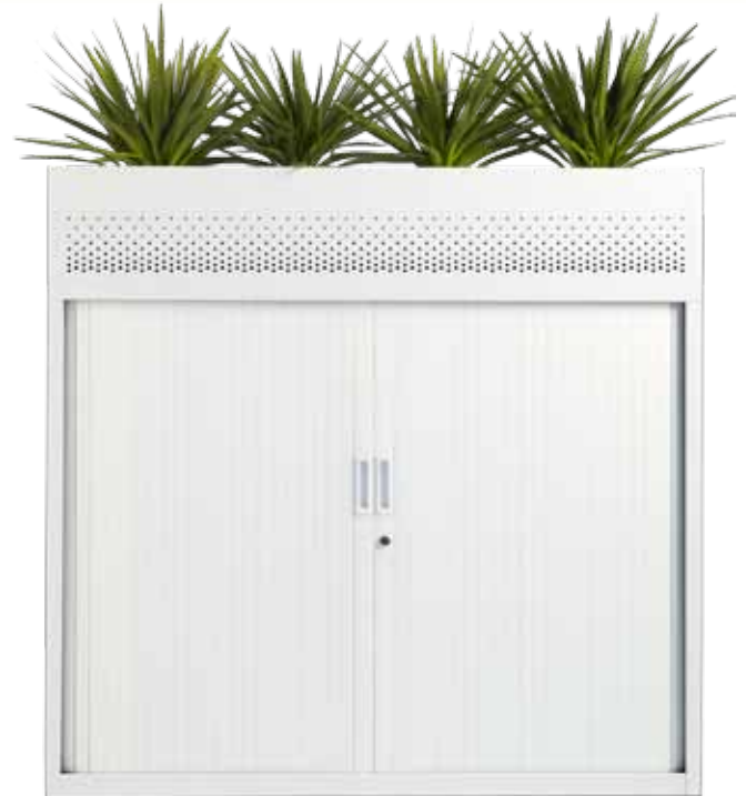
Smartstore Planter perforated