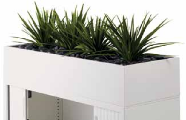
Smartstore Planter plain