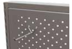
steel peg panel & prong