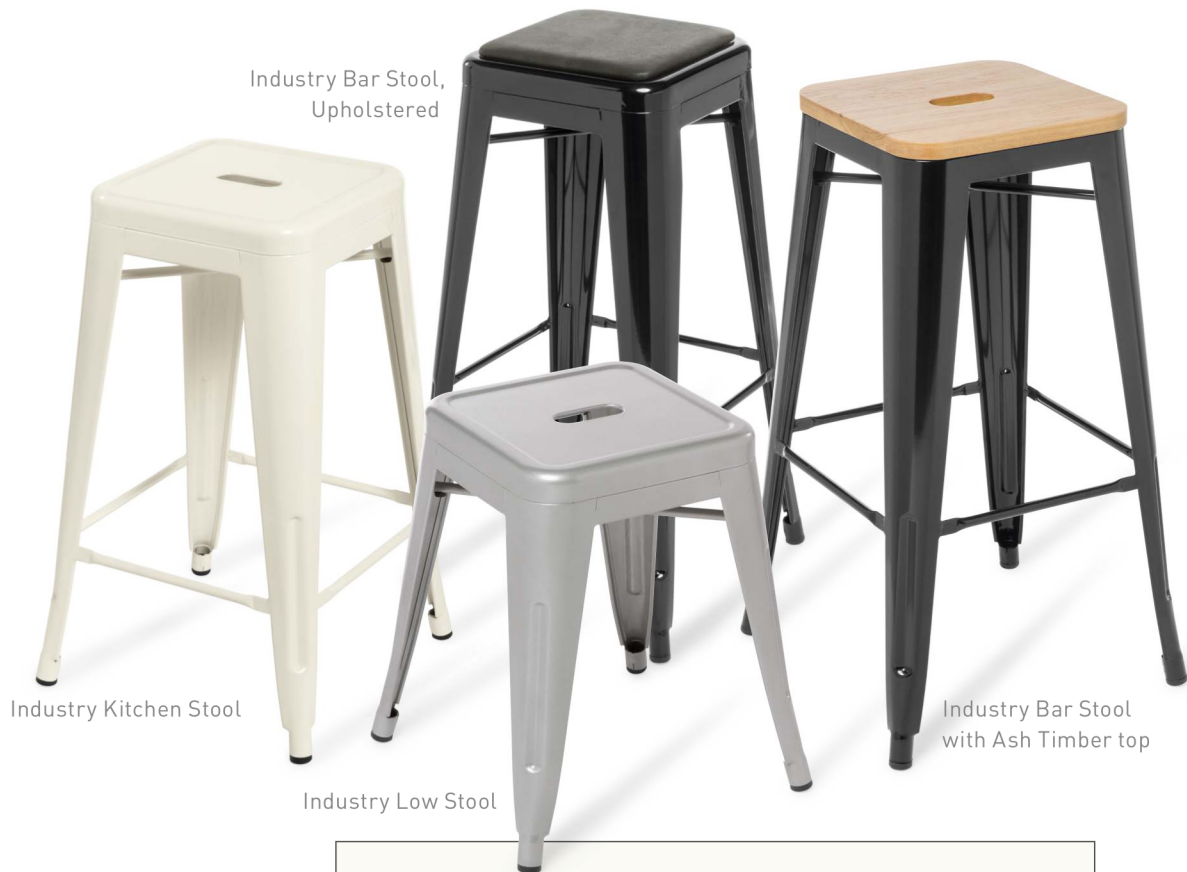
Industry Bar Stool, Upholstered