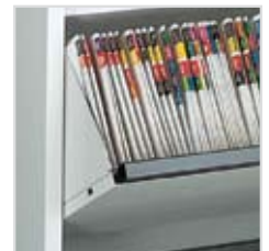
Efficient use of space